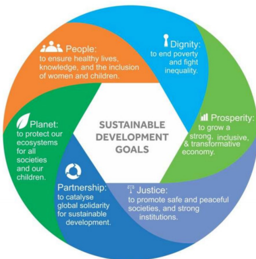
Figure 4: 'Six essential elements for delivering the SDGs' from United Nations Synthesis Report